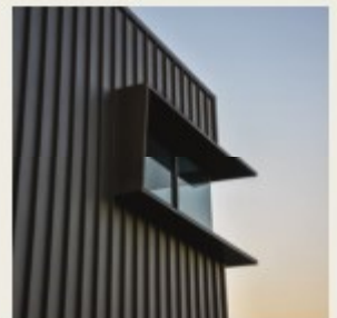
Wall colour: Monument® Matt

When you purchase COLORBOND® steel Matt you are buying products made and backed by BlueScope, one of Australia's largest manufacturers. BlueScope offers a range of warranties of up to 36 years for peace of mind 1 .