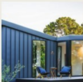
Wall colour: Monument® Matt

For over a decade COLORBOND® steel Matt has undergone real world exposure testing and accelerated laboratory testing at BlueScope sites in Australia. COLORBOND® steel Matt is also manufactured in Australia and compliant with relevant Australian Standards.