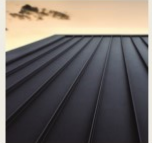
Roof colour: Monument® Matt

WHEN YOU CHOOSE COLORBOND® STEEL MATT for your design, you're not only making an enduringly stylish choice, you're making a sensible one too.