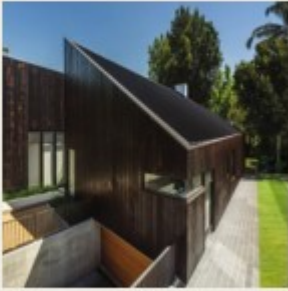
Roof colour: Monument® Matt

WHEN YOU CHOOSE COLORBOND® STEEL MATT for your design, you're not only making an enduringly stylish choice, you're making a sensible one too.