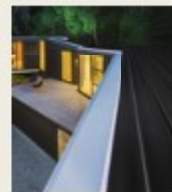
Roof colour: Monument® Matt

To achieve this finish, these five neutral COLORBOND® steel colours have been enhanced using BlueScope's innovative Matt paint technology, creating a softer, more subtle look. This purely aesthetic change has been purposely designed to create a true Matt finish whilst retaining the durability you'd expect from COLORBOND® steel. Tested for over a decade, COLORBOND® steel Matt has been designed to withstand our harsh Australian environment. The result is a product which maintains its Matt finish, looking even better for longer.