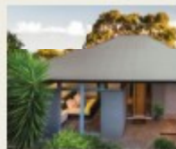
Roof colour: Shale Grey® Matt