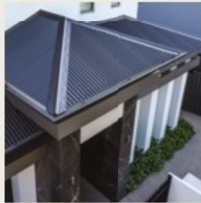
Roof colour: Monument® Matt

COLORBOND® steel Matt incorporates our unique Thermatech® solar reflectance technology, designed to reflect more of the sun's heat on hot sunny days. It also benefits from our industry-leading coating incorporating Activate® technology to provide enhanced corrosion resistance.