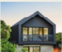
Roof and wall colour: Monument® Matt

Whisper it's colour, finish, or the freedom to create a simple flat roofing design or soaring shapes, COLORBOND® steel Matt provides you with the flexibility to realise your design vision. This contemporary finish offers a sophisticated twist, which alongside our existing COLORBOND® steel range provides even greater design opportunities.